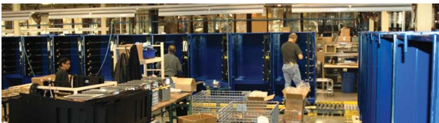
From raw materials, through assembly and final quality checks, CAP dispensing equipment is prepared for a long life of dependable service.