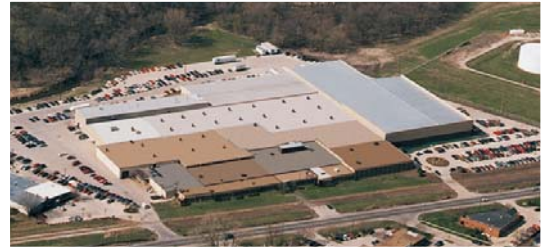
Manufactured in the Heartland, Des Moines Iowa.

Using the latest techniques including state-of-the-art computer controlled machinery and the highest construction standards, parts are stamped and formed, refined and assembled. Then every machine is checked and rechecked for optimum performance levels before entering service.